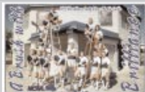
The 2001 Softball Media Guide was named "Best in the Country" by CoSIDA. The cover was also judged best in the nation.