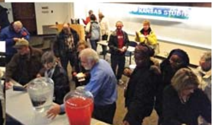
January 28, 2014