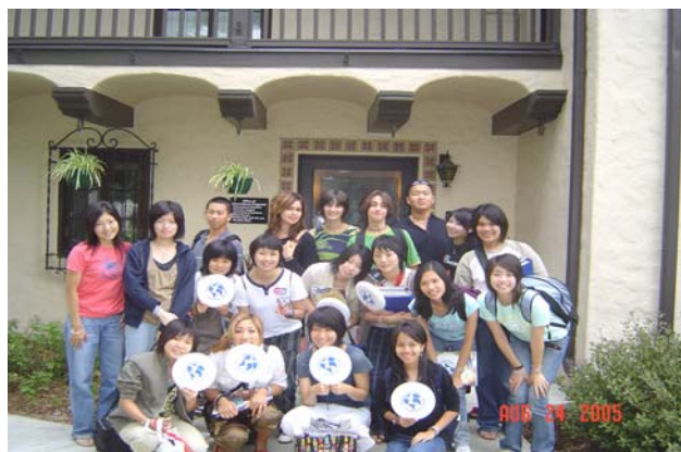
19 participants of the Association of American-Scandinavian Exchange program visited Washburn