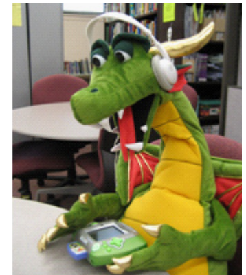
Hand-held digital learning games