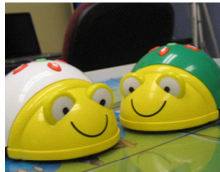
Bee Bots mathematical robots for early learners